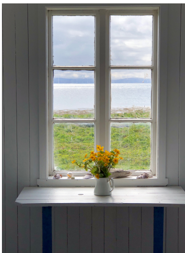
From the hallway in one of the cabins