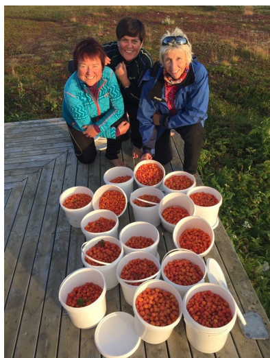
Quite the harvest