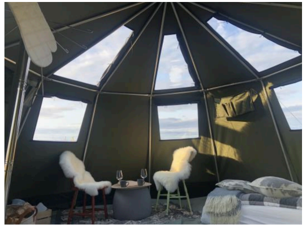
Nice and bright inside