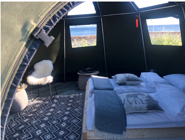
You'll sleep well here

Get the ultimate nature experience and relax far away from the chores of everyday life. This fabric goahti is located just above the shoreline on the north end of the island, with views of the Sværholdt peninsula and Arctic ocean. Experience wilderness camping with a luxurious twist. You can choose to combine your trip by staying in both of our goahtis, each located on opposite sides of the island, or just stay in one of them.