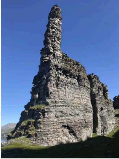
The tower at Castle Bay