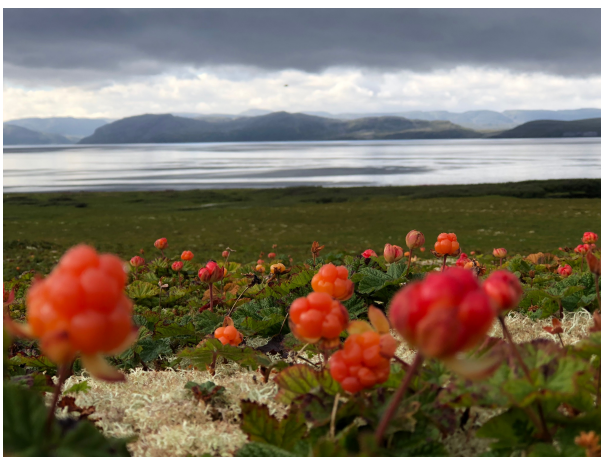
Maybe there'll be cloudberry for dessert

Experience the Sværholt peninsula from the sea. We make landfall in magical Castle bay, and combine this refreshing rafting trip with spending the night at Tamsøya.