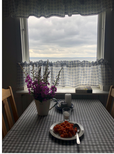
From one of the rooms