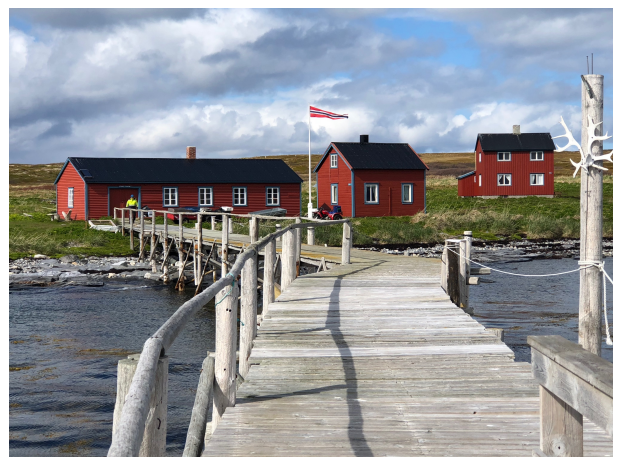
The southern end of the island