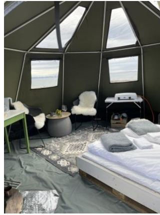
Nice view from inside.