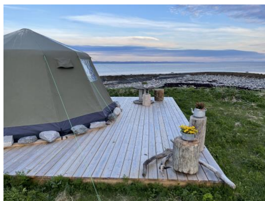
Right by the seaside

The RIB rafting trip departs from Repvåg at 6pm and will take about 15 minutes. Olaf will meet you at the old ferry pier and provide you with floatation suits and life vests, and then take you to the island. If you need a parking space for your car, we have free and available spots along the fence of the big blue house with an adjacent red barn.