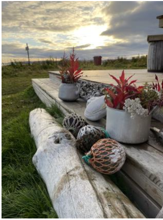
The south end.