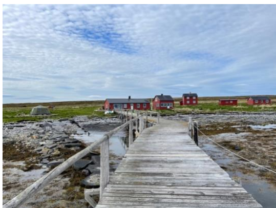
the quay and the houses

Experience the Sværholt peninsula from the sea. We make landfall in magical Castle bay, and combine this refreshing rafting trip with spending the night at Tamsøya.